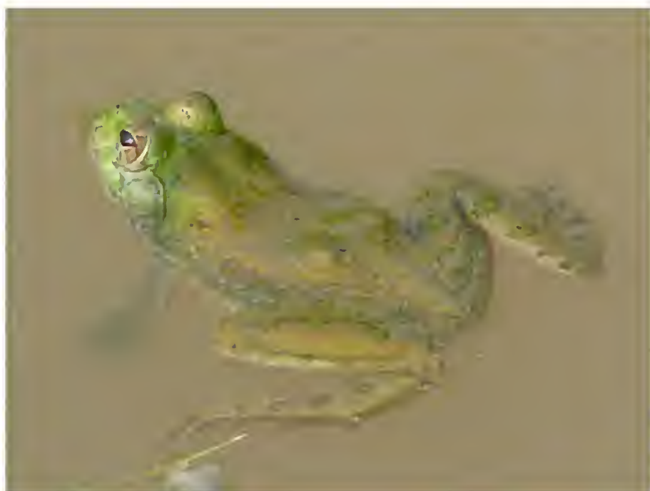
Fig. 2C. Skittering Frog Euphlyctis cyanophlyctis .